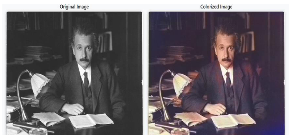
Fig.1 Upload grayscale image Output: colored image

Fig. 1, Fig. 2, and Fig. 3 show how the Black & White Image Colorizer web application works. First, the user uploads a black-and-white (grayscale) photo. The system then sends this image to a trained Convolutional Neural Network (CNN), which has learned how to add natural colors to grayscale pictures. The model studies the brightness details of the image and predicts the missing color information. In the figures, the left side displays the original grayscale input image, while the right side shows the automatically colorized output. The output looks more natural and lifelike, giving the old black-and-white photo a realistic appearance. These results highlight the main feature of the project—taking a simple grayscale image and turning it into a color version without any manual editing. This makes old photos more meaningful and visually appealing with the help of deep learning.