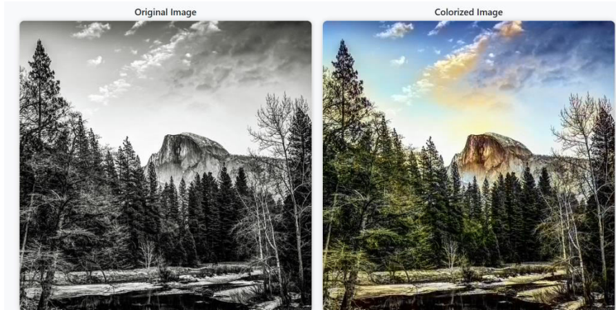
Fig.2 Upload grayscale image Output: colored image