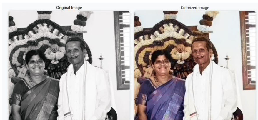
Fig.3 Upload grayscale image Output: colored image